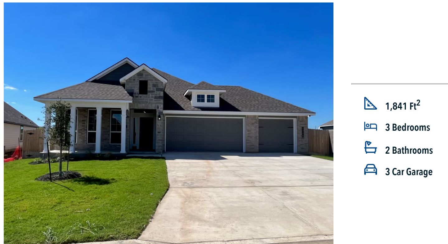
Some images shown may be from a previously built Stylecraft home of similar design. Actual options, colors, and selections may vary. Contact us for details!

If charm and elegance are what you're looking for - Welcome home! A favorite of many, the 1818 has several features that make it stand out from the rest. From the moment your eyes catch the stunning exterior, you're captivated. Interior features include dual living areas to use as you choose, a large kitchen with granite-topped island that is open through the dining and living room, stunning windows flowing with natural light, an optional study alcove, and a spacious primary suite. Stylecraft's selections round out everything that make this floor plan so special.