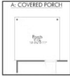
SLAB ELEVATION DIMENSIONS