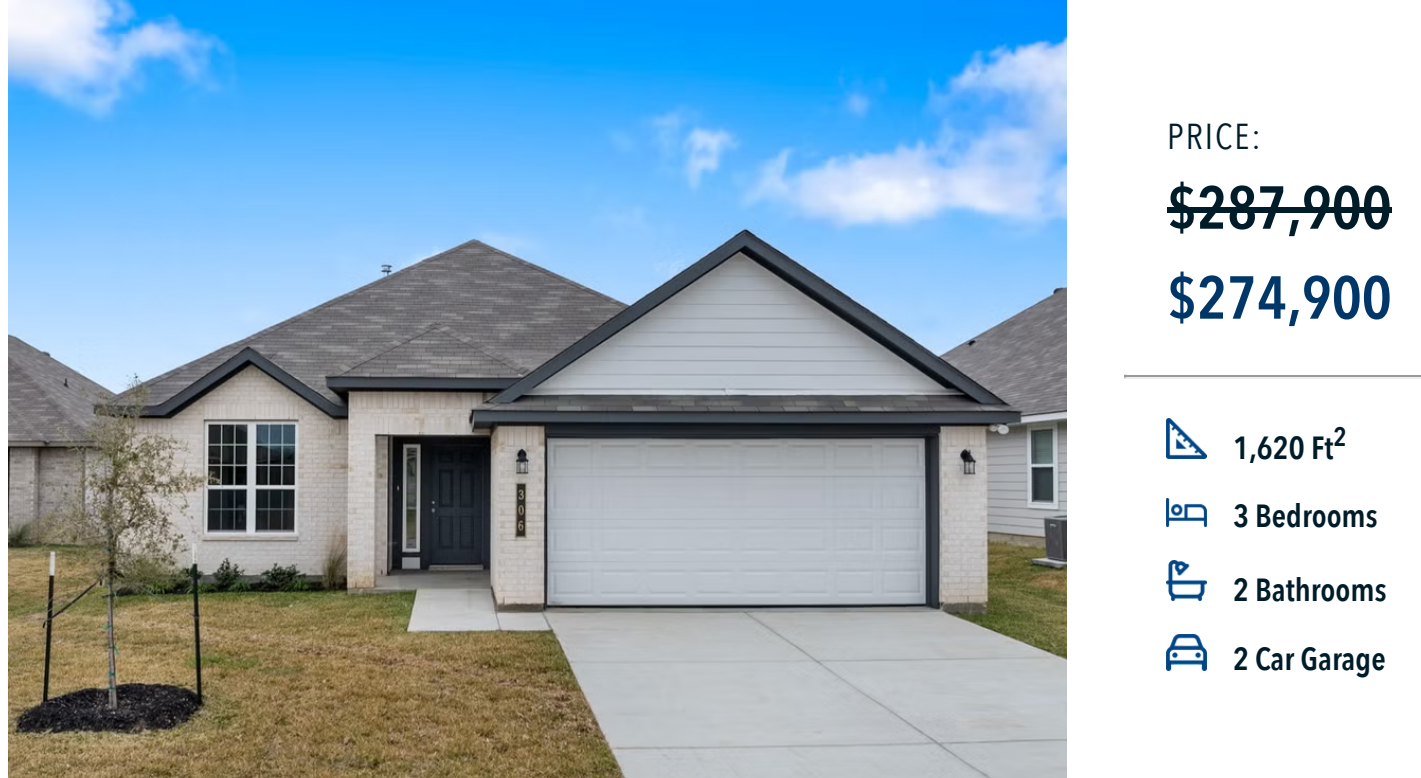
Some images shown may be from a previously built Stylecraft home of similar design. Actual options, colors, and selections may vary. Contact us for details!

This charming 3 bedroom, 2 bath home is known for its intelligent use of space and now features an even more open living area. The large kitchen granite-topped island opens up to your living room to provide a cozy flow throughout the home. Your dining room features the most charming front window you'll ever see, which is accented by a gorgeous front elevation. Featuring large walk-in closets, luxury flooring, and volume ceilings - the 1613 certainly delivers when it comes to affordable luxury.