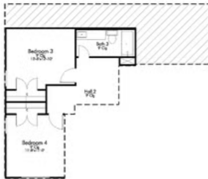
1.) 2 BEDROOMS, 1 BATH