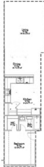
1.) BEDROOM SUITE